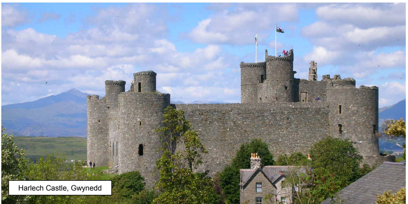
Harlech Castle, Gwynedd

Cadw: http://cadw.wales.gov.uk National Trust: http://www.nationaltrust.org.uk Landmark Trust: http://www.landmarktrust.org.uk/