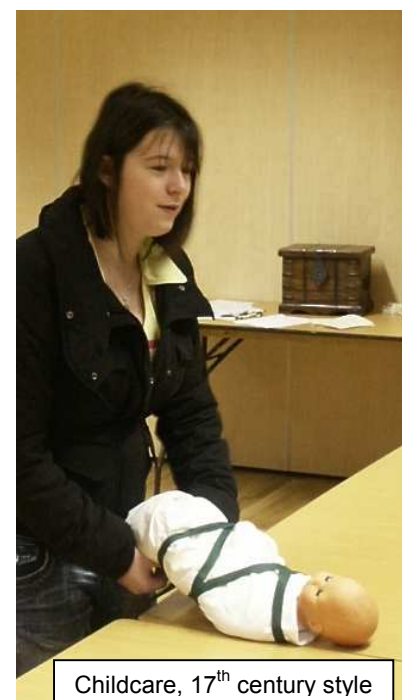
Childcare, 17 th century style