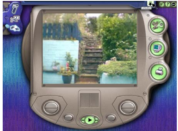
40. To save your film so you can view it outside of the Digital Blue software, open the Permanent Collection again.