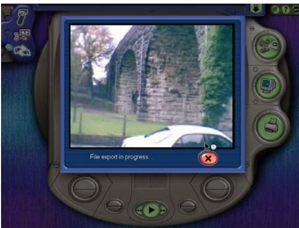
43. The software converts your movie into an .AVI file and saves it onto the desktop of your computer.