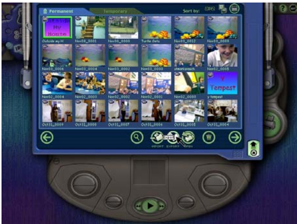
41. Select your movie from the collection by clicking on it and click on Export .