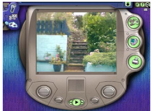
44. Exit the Digital Blue software.