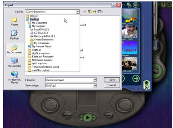
42. Choose where you want to save your exported movie. Here I am choosing the Desktop of my computer. Click on Save .